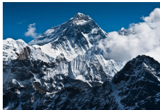
Mount Everest 8,849m