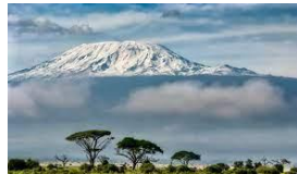
Mount Kilimanjaro 5,895m