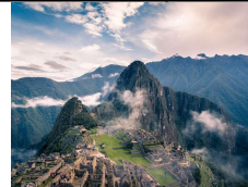
Machu Picchu 2,430m