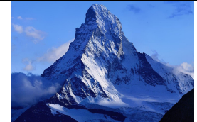
The Matterhorn 4,478m