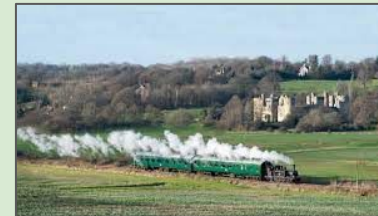
Kent and East Sussex Railway