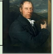
Richard Trevithick 1771 - 1833