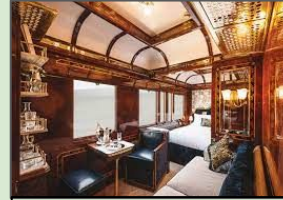
Orient Express 1883 to date