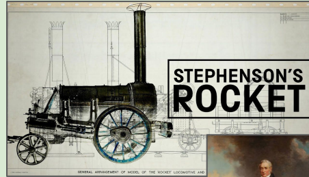
George Stephenson 1781 - 1848

Train - a series of railway carriages or wagons pulled by a locomotive.