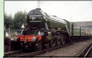
The Flying Scotsman